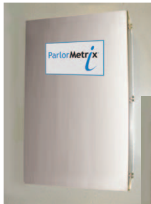
Modular ParlorMetrix Control Panel