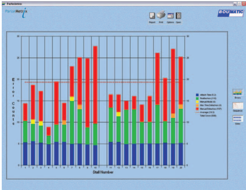
Parlor stall performance